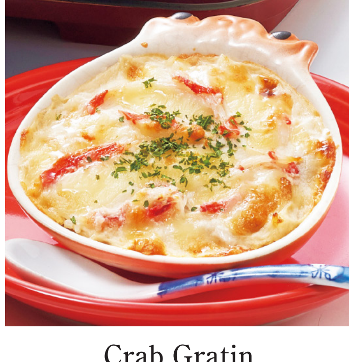
Crab Gratin 580YEN (w/tax 638YEN)