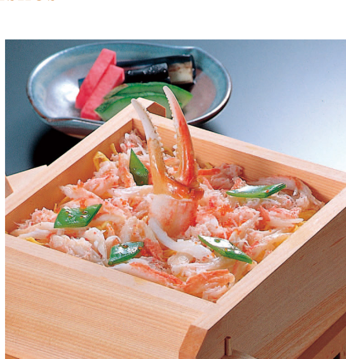
Steamed crab rice 1,880YEN (w/tax 2,068YEN)