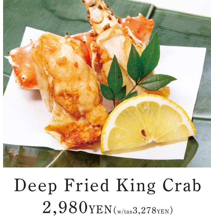
Deep Fried King Crab 2,980YEN (w/tax 3,278YEN)