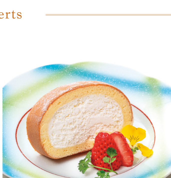
White Roll 480YEN (w/tax 550YEN)