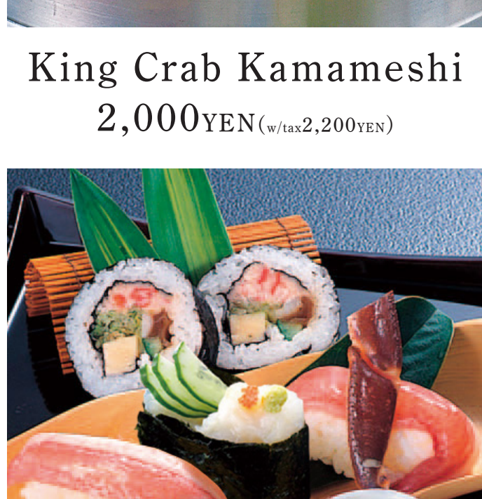
Crab Sushi Assortment 1,980YEN (w/tax 2,178YEN)