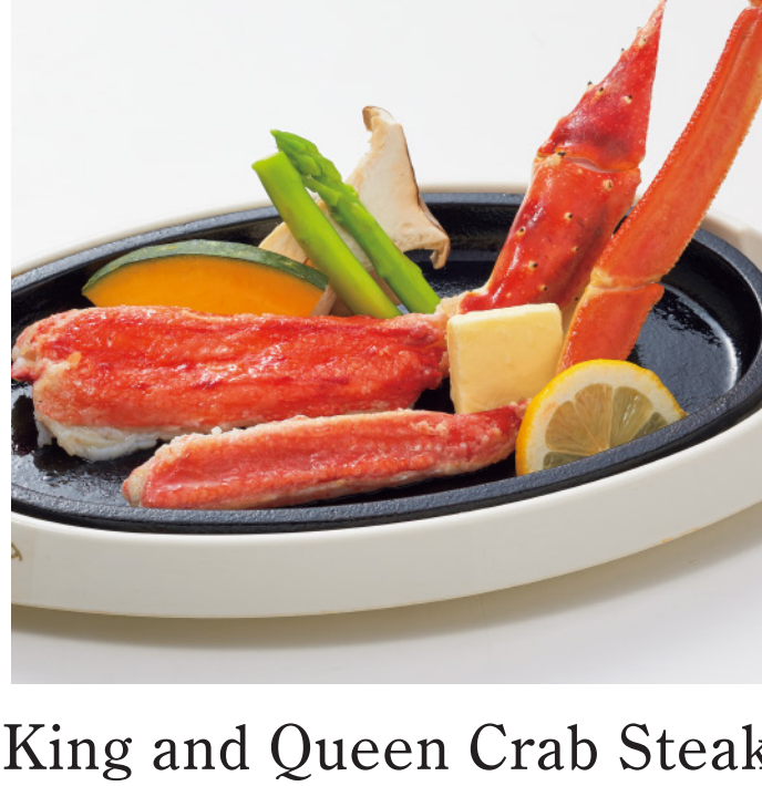
King and Queen Crab Steak 3,500YEN (w/tax 3,850YEN)