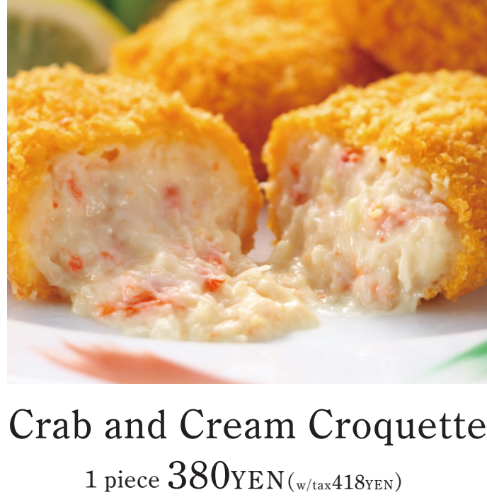
Crab and Cream Croquette 1 piece 380YEN (w/tax 418YEN)