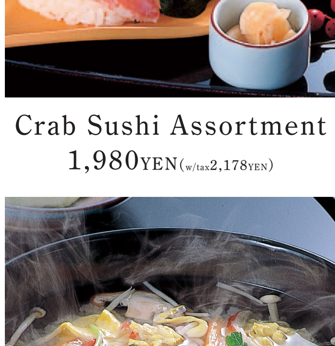
Crab Rice Porridge 1,280YEN (w/tax 1,408YEN)