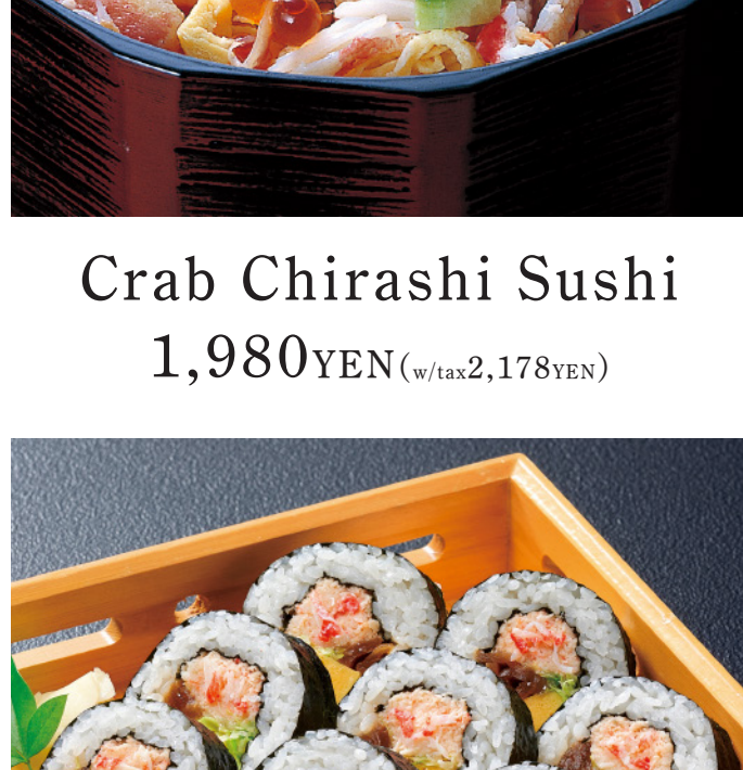
Crab Futomaki Sushi Roll 10 pieces 1,680YEN (w/tax 1,848YEN)