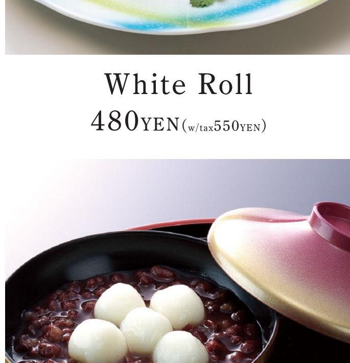
Shiratama Zenzai 450YEN (w/tax 495YEN)