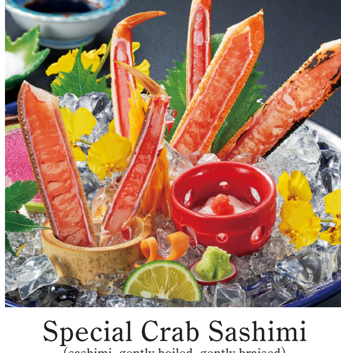
Special Crab Sashimi (sashimi, gently boiled, gently braised) 2,980YEN (w/tax 3,278YEN)