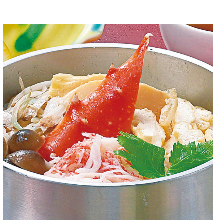
King Crab Kamameshi 2,000YEN (w/tax 2,200YEN)