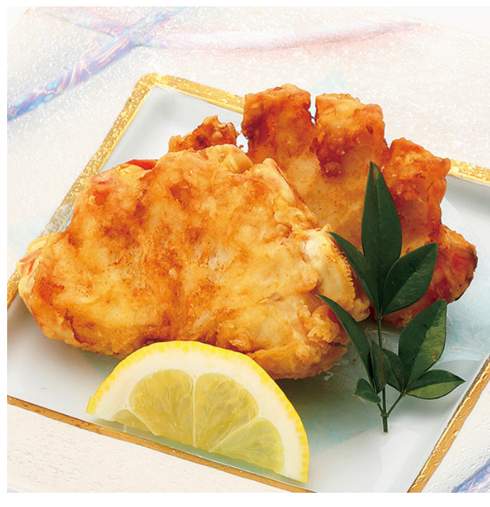
Deep Fried Crab Shoulder 780YEN (w/tax 858YEN)