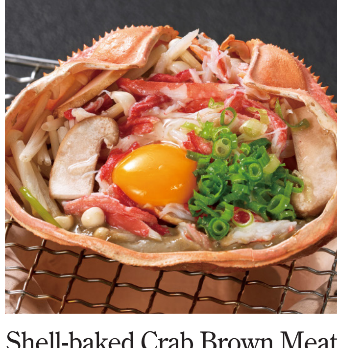
Shell-baked Crab Brown Meat 980YEN (w/tax 1,078YEN)